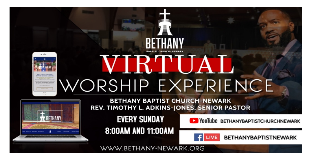
ADDRESSING THE CORONAVIRUS (COVID-19)