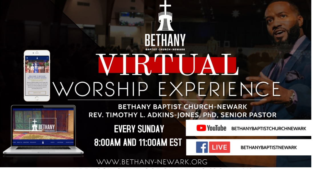
ADDRESSING THE CORONAVIRUS (COVID-19)