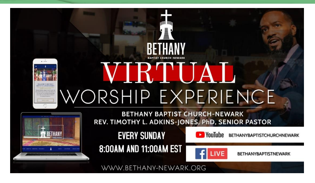
ADDRESSING THE CORONAVIRUS (COVID-19)