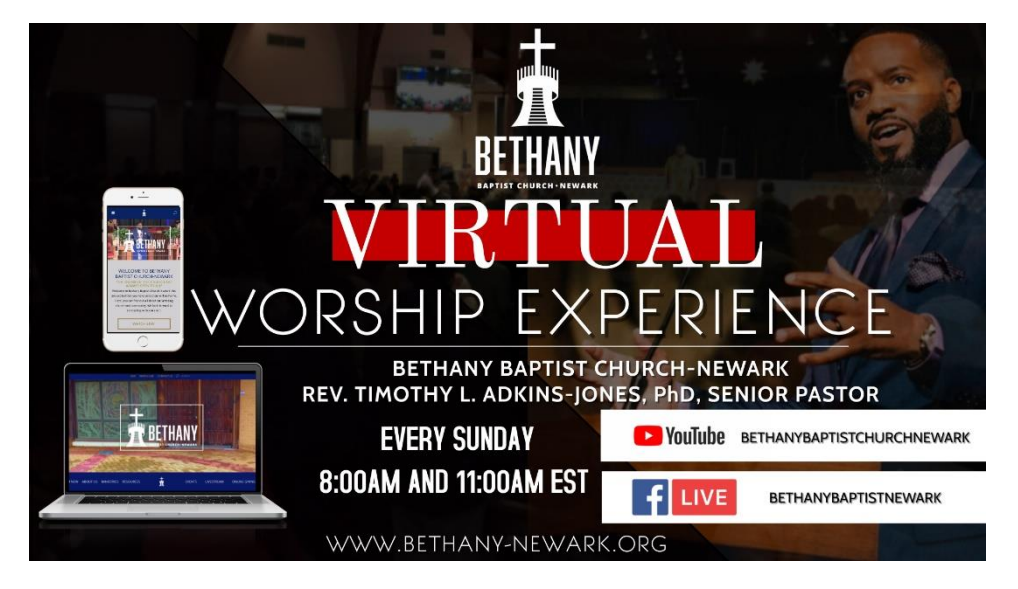
ADDRESSING THE CORONAVIRUS (COVID-19)