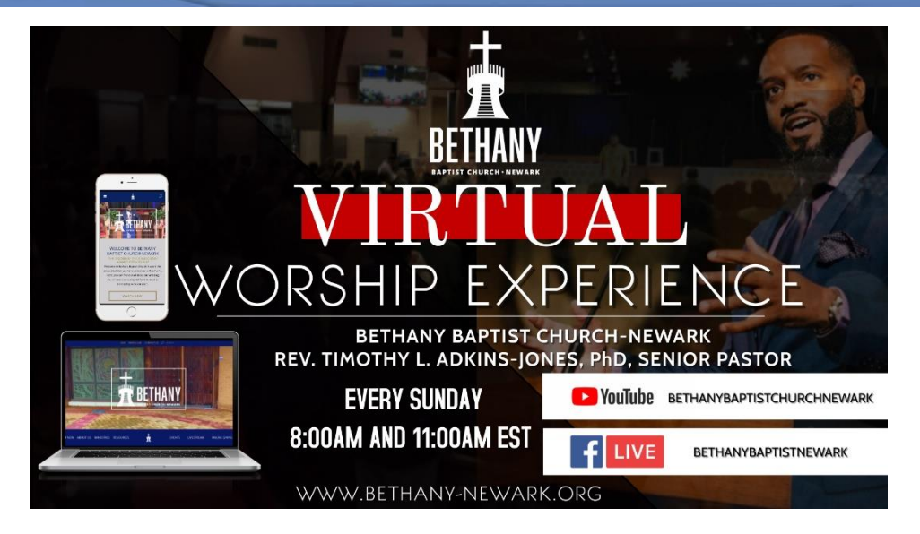
ADDRESSING THE CORONAVIRUS (COVID-19)